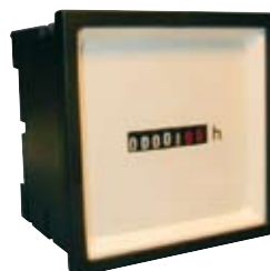
HK 48, HK 49